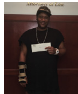
Winner of Washington vs. Dallas Tickets

Be on the lookout for future raffles and additional chances to win. We appreciate you and want to show it!